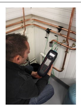
DHW network temperature