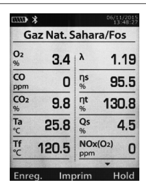
Example of analysis